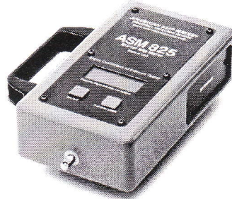
Model ASM 825 Digital